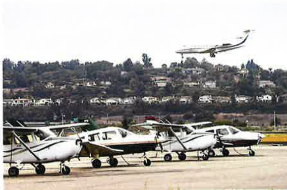
LANDING—Private planes like those pictured above are common at the Camarillo Airport.

This month, the Ventura County Department of Airports will launch updates to two critical documents for the Camarillo Airport: the airport layout plan and the noise compatibility program.