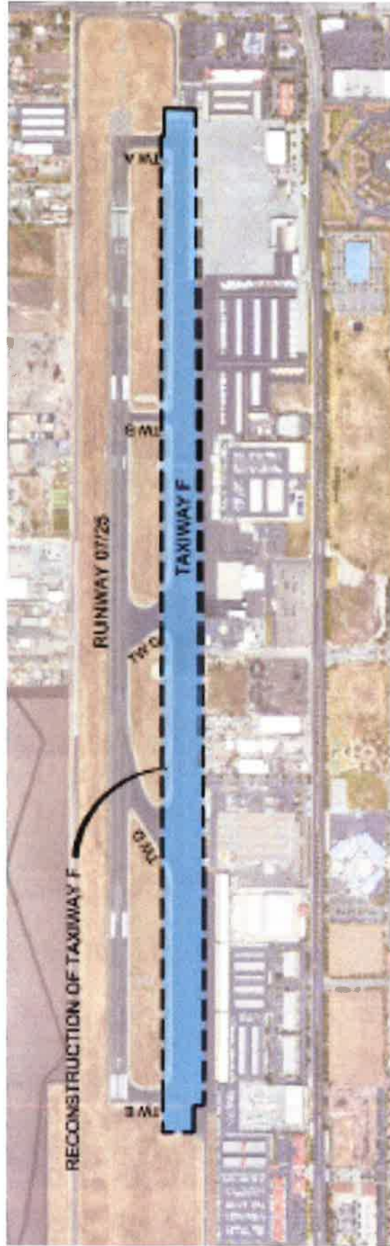
Taxiway F Reconstruction