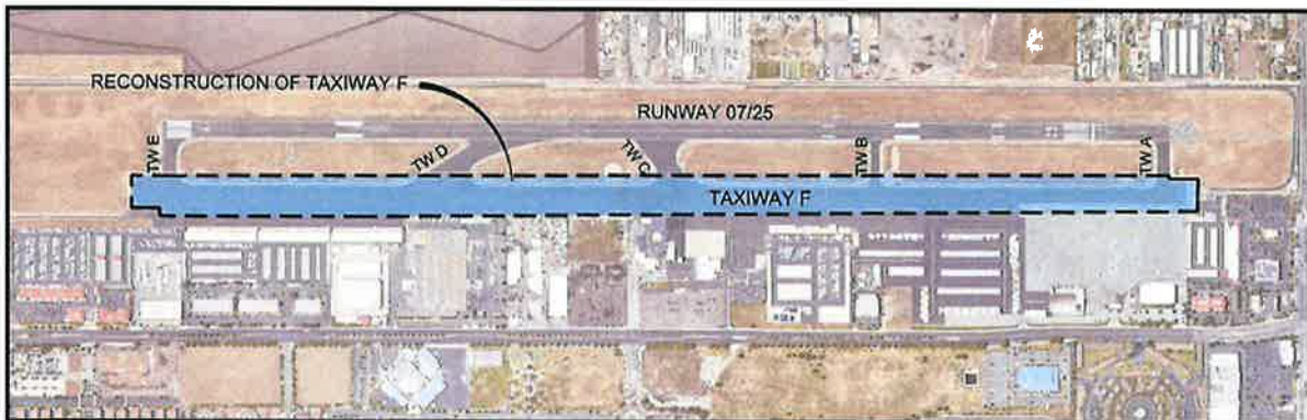
EXHIBIT NO. 1

The as-bid construction cost for the reconstruction of Taxiway F under AIP Project No. 3-06-0179-038- 2020 ranged from $9,985,545.00 to $14,416,562.50. It should be noted that the bid prices shown above do not include any phased construction schedule, as the original project would have accomplished the work during a planned full closure of the runway and taxiways. For the rebid of the Reconstruction of Taxiway F project, work will be phased to minimize runway and airport closures which will include night work, phased taxiway completion, and other possible phasing requirements which might impact project construction costs. The as-bid construction budgets shown above do not include administrative, legal, or professional fees.