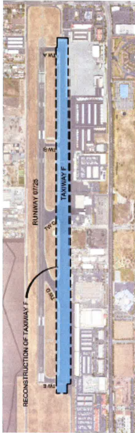
Taxiway F Reconstruction