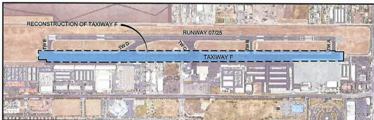
EXHIBIT NO. 1

The as-bid construction cost for the reconstruction of Taxiway F under AIP Project No. 3-06-0179-038- 2020 ranged from $9,985,545.00 to $14,416,562.50. It should be noted that the bid prices shown above do not include any phased construction schedule, as the original project would have accomplished the work during a planned full closure of the runway and taxiways. For the rebid of the Reconstruction of Taxiway F project, work will be phased to minimize runway and airport closures which will include night work, phased taxiway completion, and other possible phasing requirements which might impact project construction costs. The as-bid construction budgets shown above do not include administrative, legal, or professional fees.