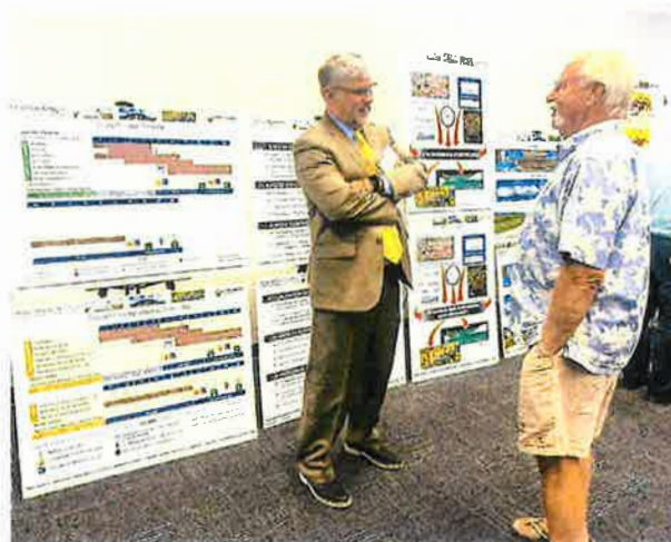
COMMUNITY SOUNDS OFF—Members of the public heard from noise consultants and airport officials during a Department of Airports workshop Sept. 26 in Camarillo.

For many residents who attended the Ventura County Department of Airports' Sept. 26 workshop on the Camarillo Airport's noise compatibility study, frustration with noisy jets turned to cautious optimism about potential solutions.